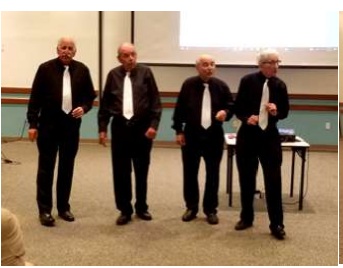
Cameo Quartet Singers

On December 14th 49 members and guests attended the luncheon at Miller's Ale House. Everyone had a good time visiting with one another, sharing old stories and enjoying a nice lunch.