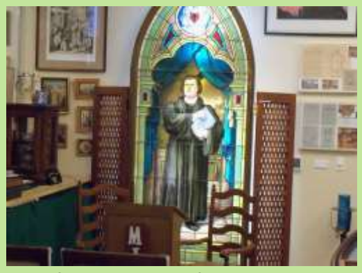
Beautiful Stained Glass Of Martin Luther - just one of thousands of artifacts on display