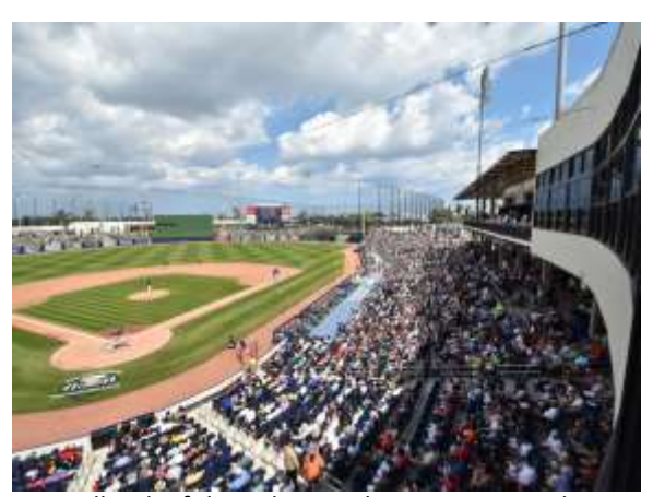
Ballpark of the Palm Beaches - 1st Base Side